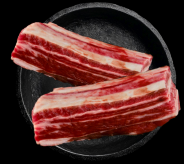
Beef Rib + $10.00