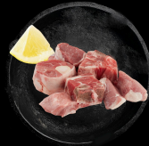
Oxtail + $5.00